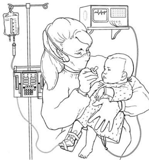
Picture 1 Keep the room lights dim and hold your child.

Your child may receive oxygen. He may need to be connected to a heart monitor or an oxygen saturation monitor. These monitors help the nurses to watch your child closely.