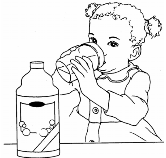
Picture 1 Give liquids to prevent dehydration.

When children are vomiting they usually don't feel like eating solid food. If your child feels like eating, it won't hurt him, but he must also drink plenty of liquids. Children who don't feel like eating food still need to drink plenty of liquids to keep from getting dehydrated. After about 6 to 8 hours of giving clear liquids, try to get your child to start eating some food.