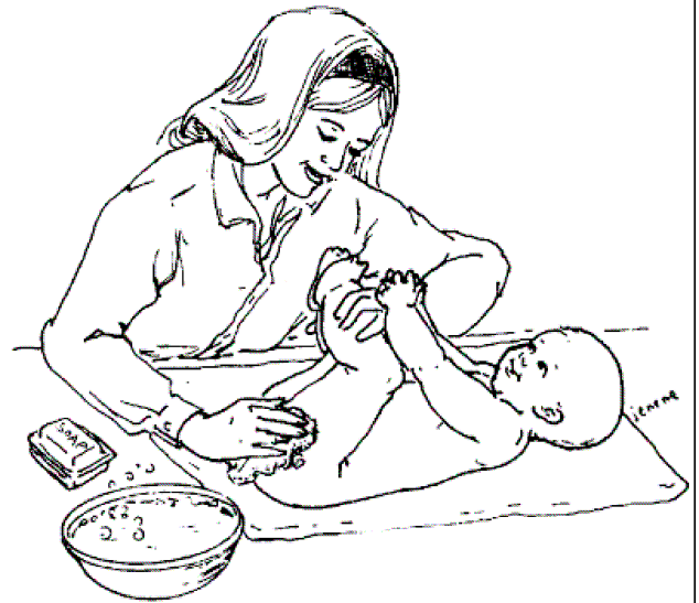
Picture 1 Wash baby well with soap and water.