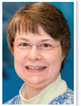
Employee of the month