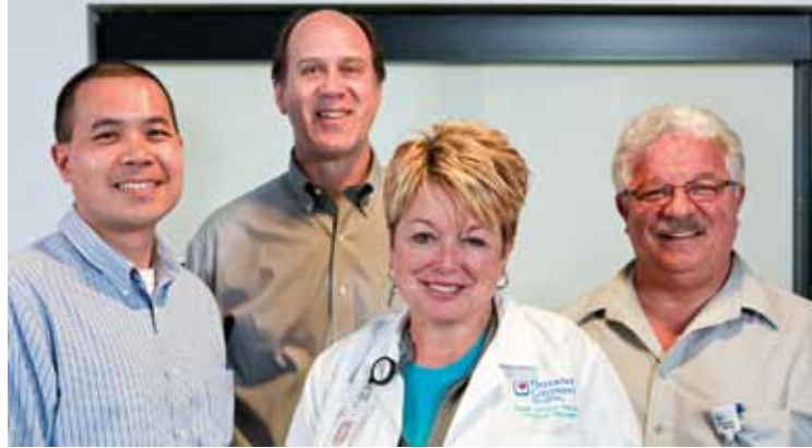
The team at Nationwide Children's who reduced blood stream infections in the Pediatric Intensive Care Unit.