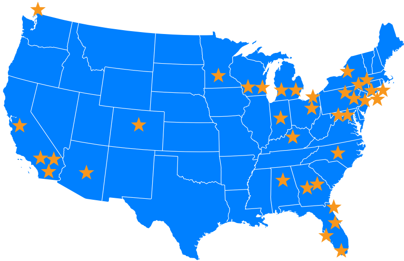
Head Start 4 – States with Open and Activated Sites

Visit NationwideChildrens.org/Next-Consortium to see our latest partnerships.