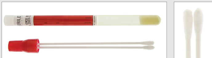
COPAN Dual Culture Swab System with Liquid Stuart's Medium