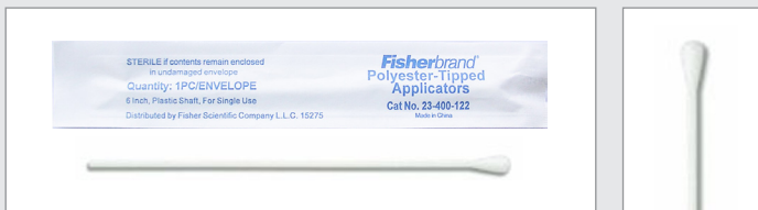
M4 Collection Kit Swab – Fisherbrand Polyester-Tipped Applicator Swab