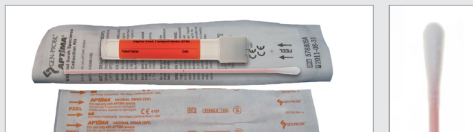
APTIMA Vaginal Swab Specimen Collection Kit (vaginal swabs)