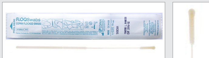
M4 Collection Kit Swab – COPAN Nylon Flocked Mini-Tipped Flexible Plastic Applicator Swab

For more information regarding microbiology swab collections, please call (800) 934-6575 or visit NationwideChildrens.org/Laboratory-Services .