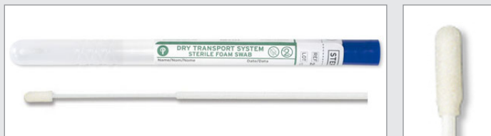
Rapid RSV – Puritan Sterile Foam-Tipped Applicator Swab