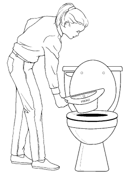
Picture 1 Females may use a plastic toilet hat to catch or collect the urine.