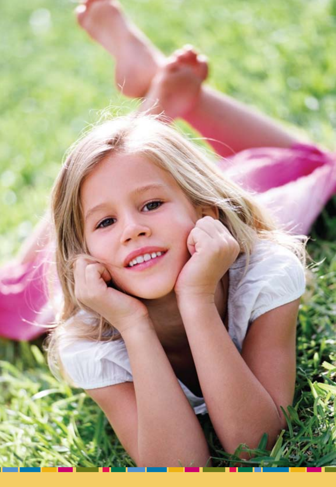
:: Have your child talk to their close friends. Peers can have a valuable role in preparing your child, as well as offering coping techniques.