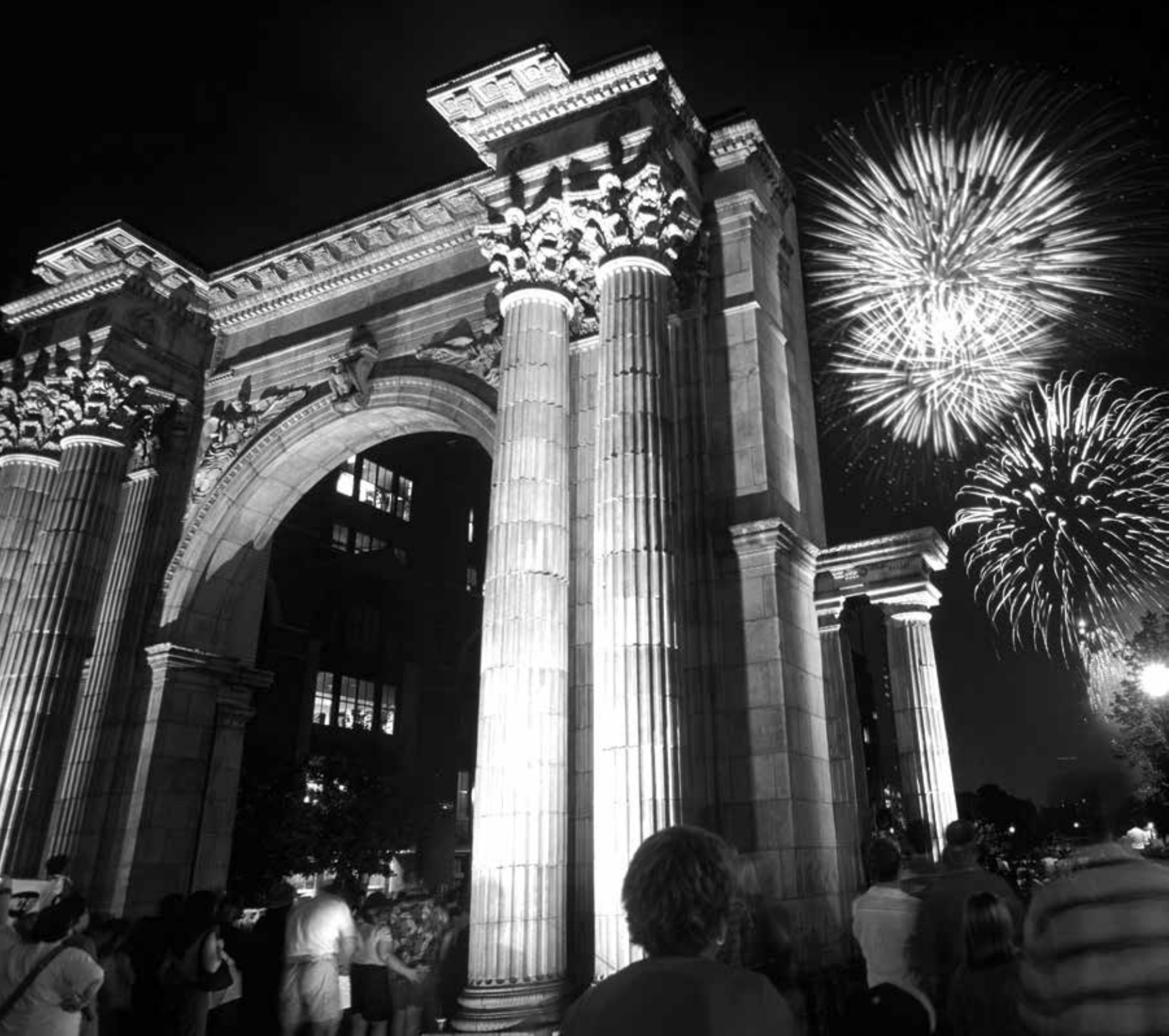
View of Red, White & Boom! from the Arena District