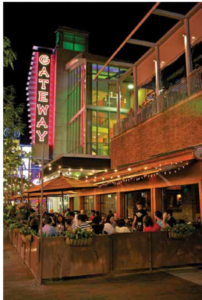
South Campus Gateway