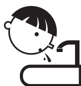
Spit out water