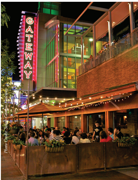
South Campus Gateway

Visit Columbus.gov , ExperienceColumbus.com and ColumbusRegion.com to learn more about Columbus.