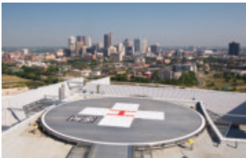
Our heated-surface helipad can accommodate a Black Hawk helicopter. The elevator delivery system is equipped with a rapid call system for immediate access from the helipad to the trauma room.