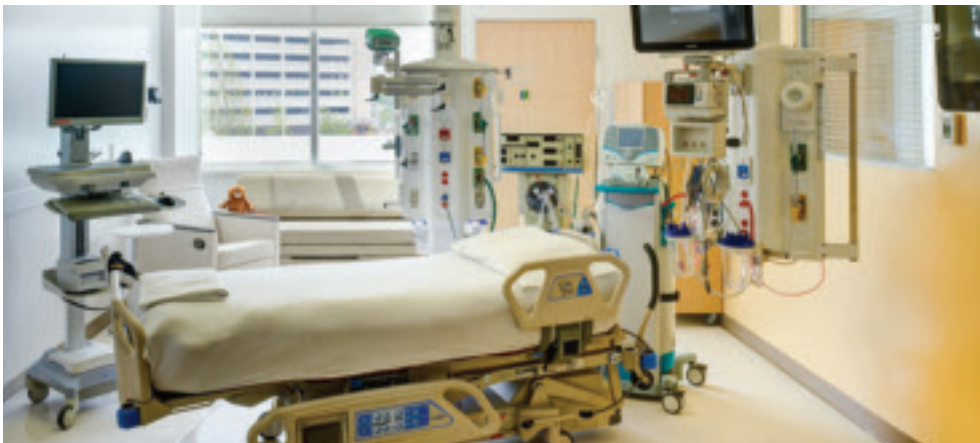
Critical care rooms have the latest technology to optimize clinical practice and patient safety.