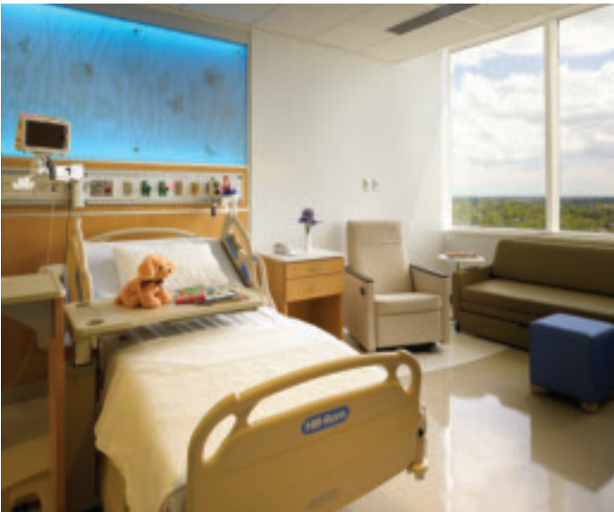
Private patient rooms are nearly 300 square feet. Each room features a LED-lit headboard, a sleep recliner and a large couch that folds out to comfortably sleep two adults.

Alongside our commitment and dedication to patient care, our campus offers an unparalleled opportunity to practice in state-of -the-art facilities that define what’s possible in patient care.