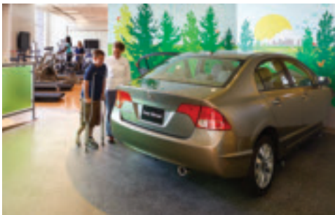
On the 9th floor, our rehabilitation area is unlike any other – with a gym, rock-climbing wall, home kitchen, school-lunch line, restaurant seating and a full-scale car.