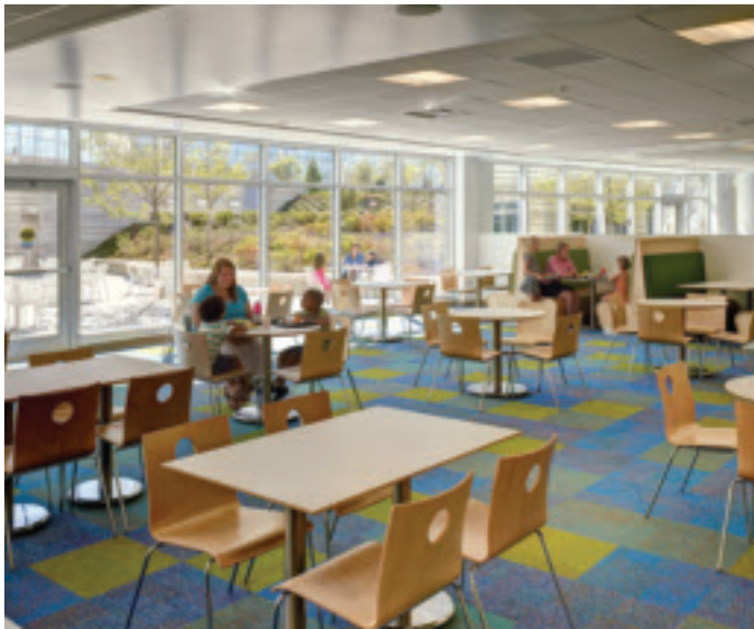
Located in the lower level, the cafeteria offers patients, families, visitors and staff a wide variety of food offerings at all hours of the day. Seating is provided in the spacious dining room, as well as the outdoor courtyard, weather permitting.