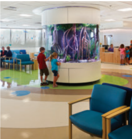
Our Emergency Department is home to Ohio’s first Level 1 pediatric trauma center. This state-of-the-art space features 62 exam rooms and a family-centered waiting area featuring a 1,400-gallon fish tank.