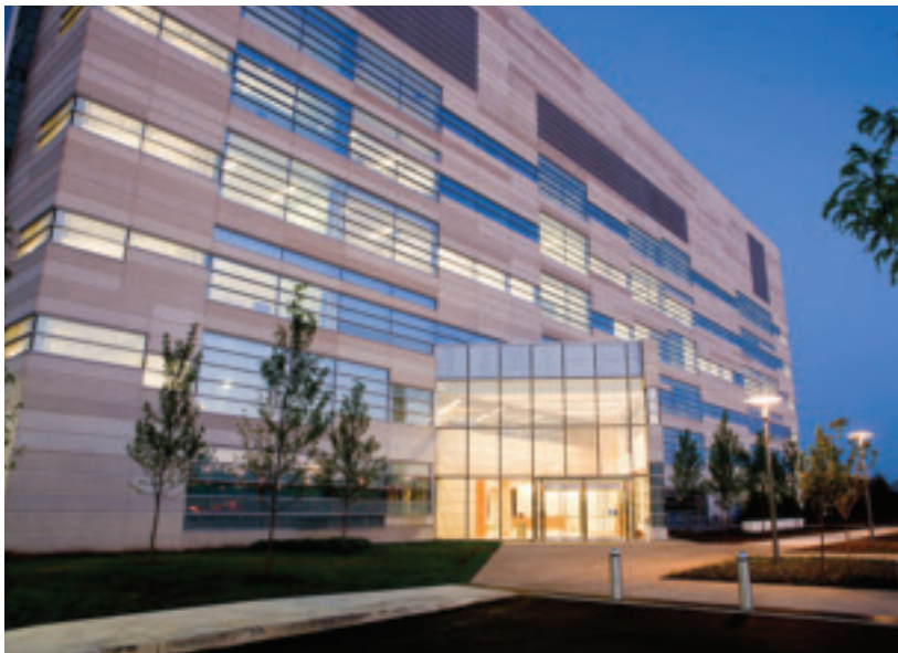
Our third research building consists of 225,000 square feet and six floors of state-of-the-art bench laboratory space, sophisticated support facilities and ample office, support and administrative space. This adds to 375,000 square feet of existing research space.