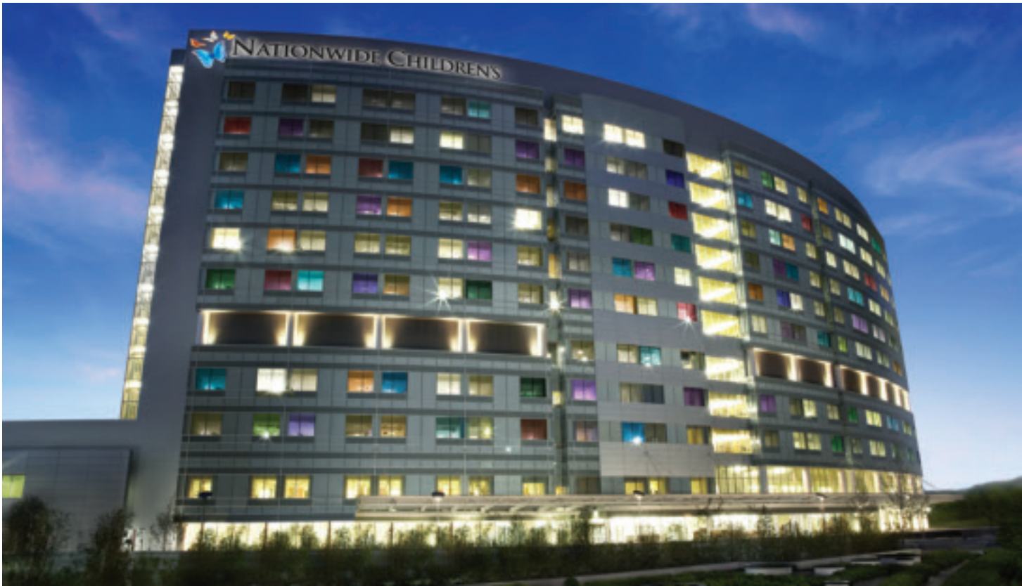
Our hospital cares for over a million patients every year.