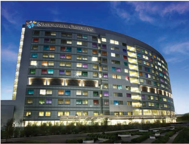
Our hospital cares for over a million patients every year.