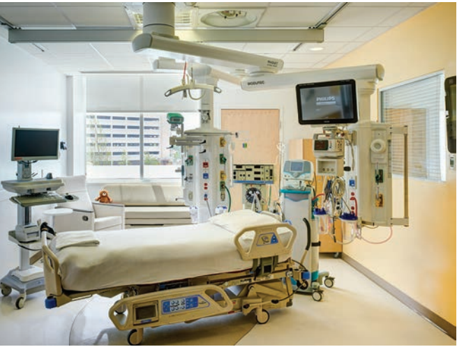
Critical care rooms have the latest technology to optimize clinical practice and patient safety.