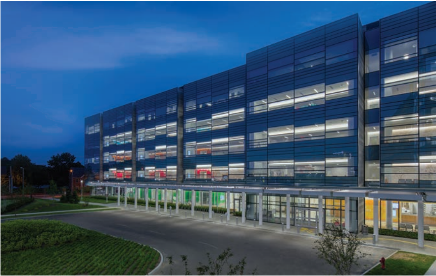
Right: The Livingston Ambulatory Center offers Adolescent Medicine, Behavioral Health, The Center for Healthy Weight and Nutrition, Dental Clinic, Laboratory services, Physical Therapy and more.