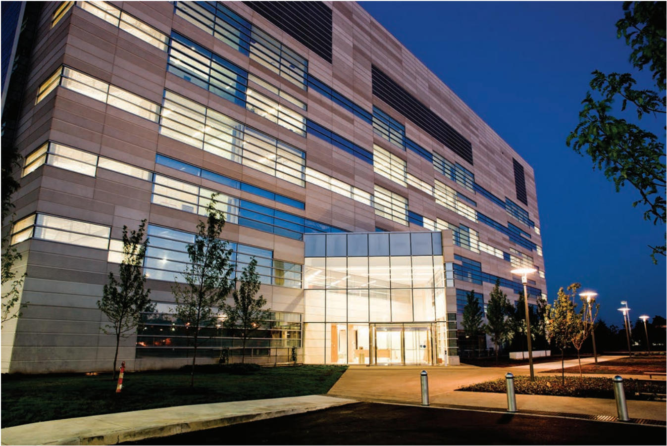
Our third research building consists of 225,000 square feet and six floors of state-of-the-art bench laboratory space, sophisticated support facilities and ample office, support and administrative space. This adds to 375,000 square feet of existing research space.