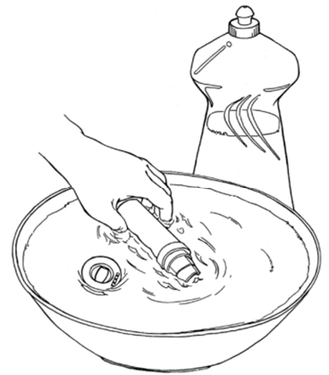
Picture 3 Clean the spacer once a week either by hand or in the top rack of the dishwasher.