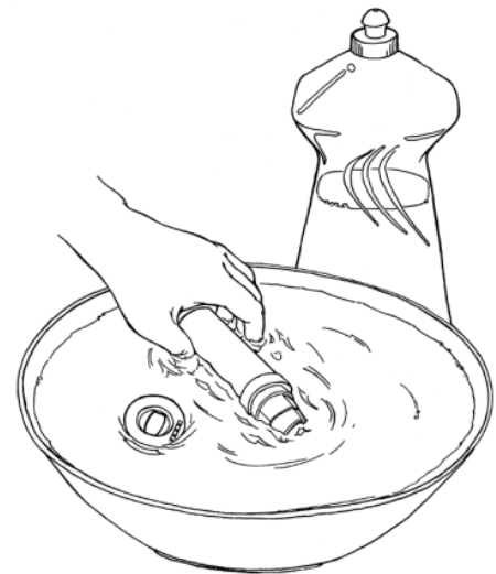
Picture 3 Clean the spacer, backpiece and mask once a week either by hand or in the top rack of the dishwasher.