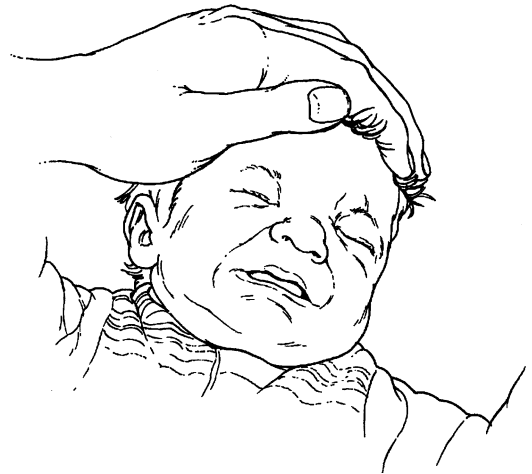
Picture 1 Gently rub the baby's head to help them fall asleep.