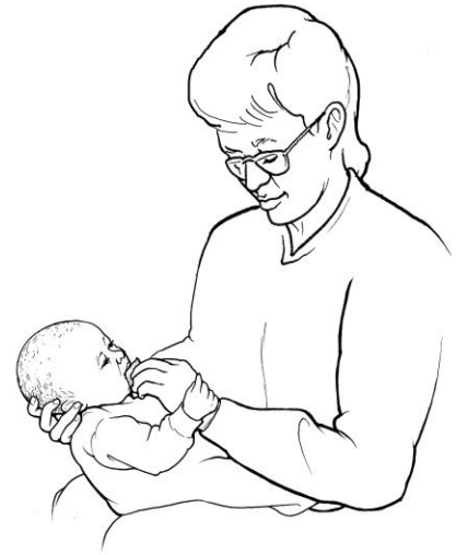
Picture 2 Clean your baby's mouth after each feeding at least twice a day.