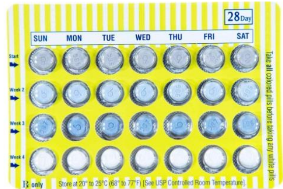
Picture 3 Birth control pills