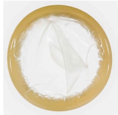
Picture 8 A condom

Condoms should be used for EVERY sexual encounter to prevent HIV and STIs (Picture 8). Other forms of birth control DO NOT protect against HIV and STIs . Condoms alone are only 82% effective at protecting against pregnancy and should be used with another form of birth control. Condoms should be used during all sexual encounters, every time, the whole time.