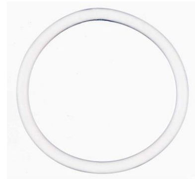
Picture 5 The vaginal ring