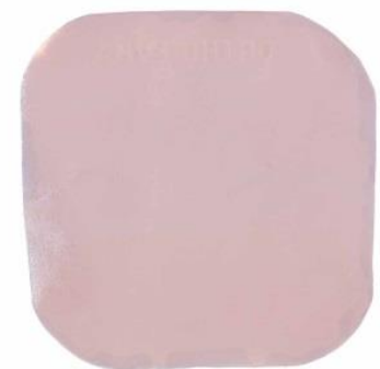
Picture 4 The patch