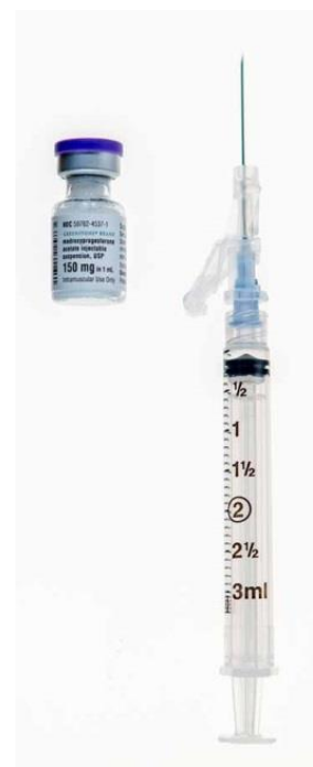
Picture 2 The shot