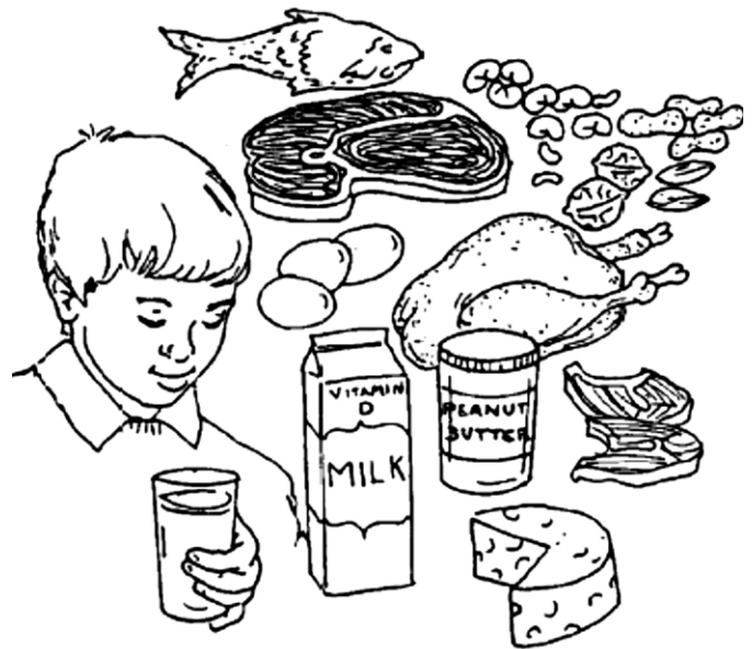
Picture 1 High calorie, high protein foods can help the body to heal.