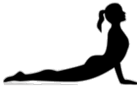
Picture 1 Cobra Pose