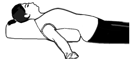
Picture 4 Fish Pose