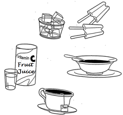
Picture 1 It is important to drink plenty of liquids after the test.