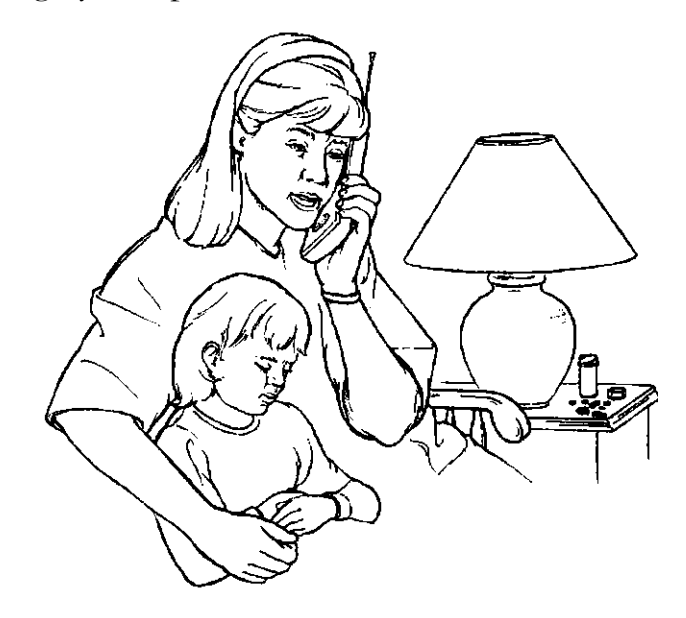
Picture 2 If you have not heard from the GI Department in 1 week after the test, call to learn the results.