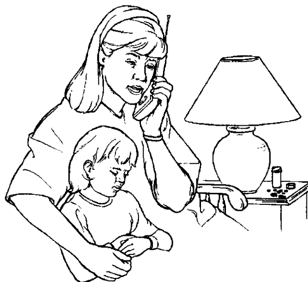
Picture 2: If you have not heard from the GI Department in 1 week after the test, call to learn the results.