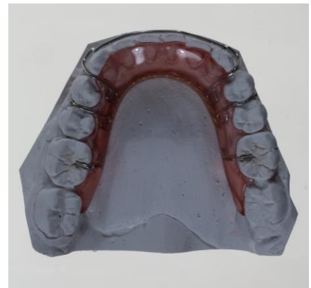
Picture 2 Hawley retainer