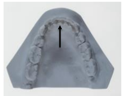
Picture 3 Fixed or bonded retainer