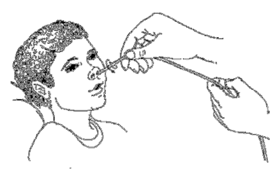
Picture 2 Suction your child's nose carefully while using a twirling motion.