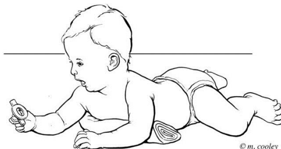
Picture 2 Tummy time on towel.