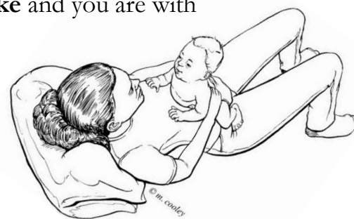
Picture 1 Tummy time on mom's chest.

Tummy time helps your baby build strength in his neck, shoulders, arms and trunk. This will help him learn to roll, sit and crawl. Belly time while he is awake also helps him maintain a round head shape.