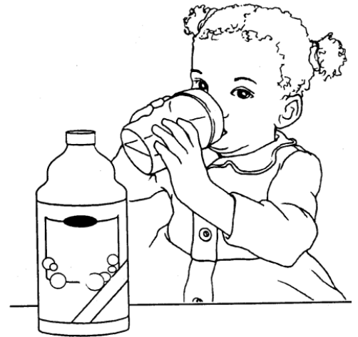
Picture 2 It is very important to drink plenty of clear liquids after the T&A.