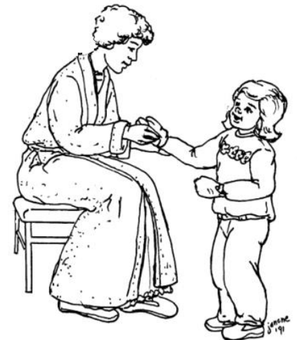
Picture 2 It may help to put socks on your child's hands to prevent scratching.