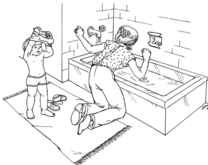
Picture 2 Check your child's skin during bathing for any signs of new boils.