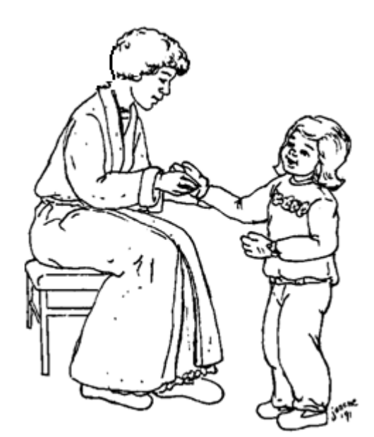
Picture 1 It may help to put socks on your child's hands to keep her from scratching the skin open.