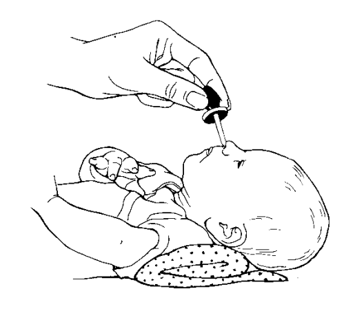
Picture 2 Saline nose drops and suctioning may help make your baby more comfortable.

• Give acetaminophen (such as Tylenol®) or ibuprofen (Motrin®) for fever. Do not give aspirin. Aspirin use in children with viral illness has been linked to Reye's syndrome, a very serious disease.