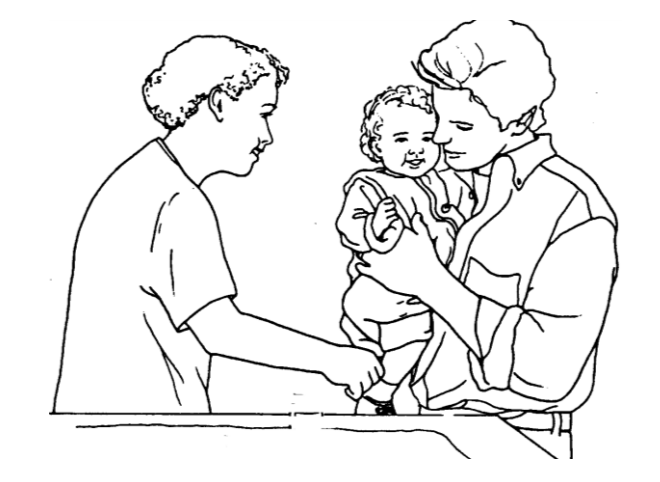
Picture 1 The doctor will examine your baby and may order some tests.

The doctor will examine your baby and may order a chest X-ray or other tests, including a swab test of your baby's nose to see if he has RSV. Your baby will probably feel better in a few days. RSV goes away on its own,