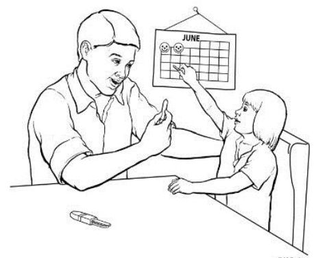
Picture 2 Pay attention to your child's good traits and reward him with praise.