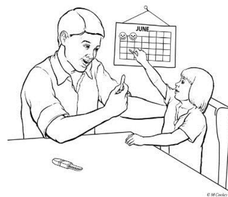
Picture 2 Pay attention to your child's good traits and reward them with praise.