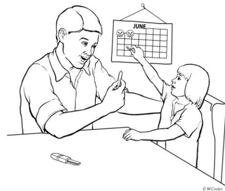
Picture 2 Pay attention to your child's good traits and reward him with praise.