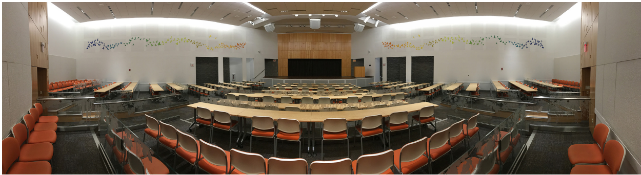
Stecker View Facing Stage