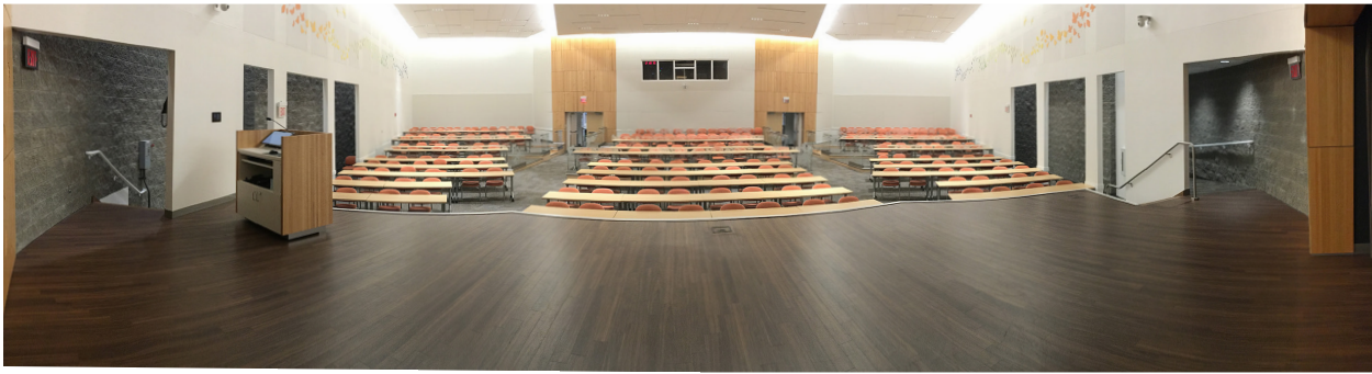
Stecker View From Stage