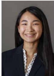
AILA CO OHIO STATE UNIV COM