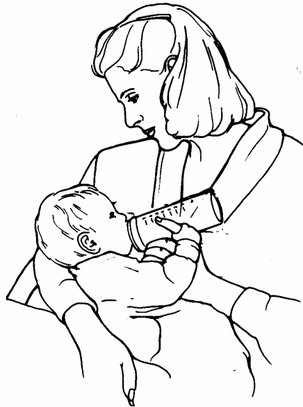
Picture 1 It's very important to give your child plenty of liquids.