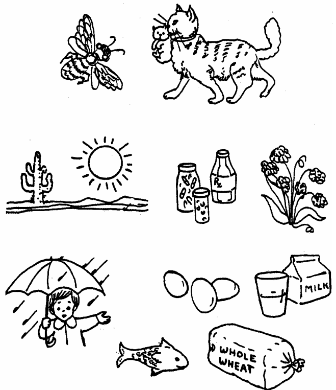
Picture 1 Some of the things that can cause hives.