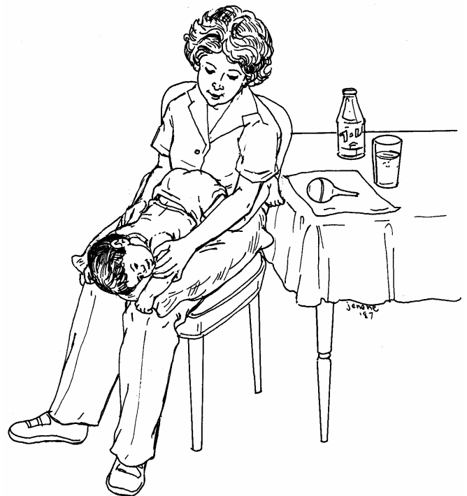
Picture 1 Holding the child in this position will help remove the mucus.