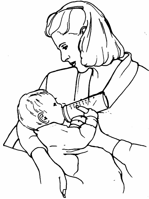
Picture 2 Hold your baby upright during feeding time.