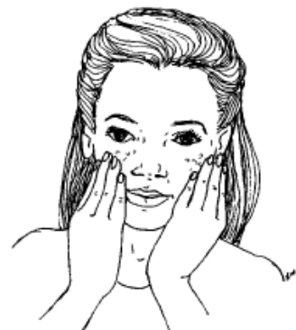
Picture 2 Wash your face gently 2 times a day.

It usually takes from 2 to 3 weeks before your skin adjusts to the medicine. Sometimes it is even longer (4 to 6 weeks) before you can see real improvement. At first you may notice more whiteheads and your skin may actually seem worse for a time. Try to be patient. Don't give up!