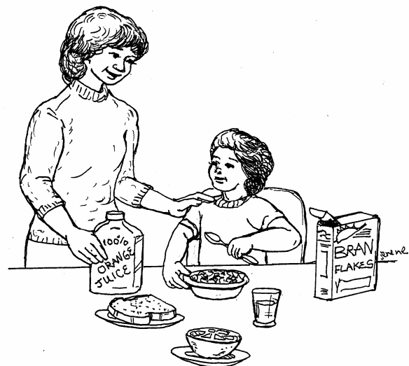
Picture 1 Encourage fiber in your child's diet.