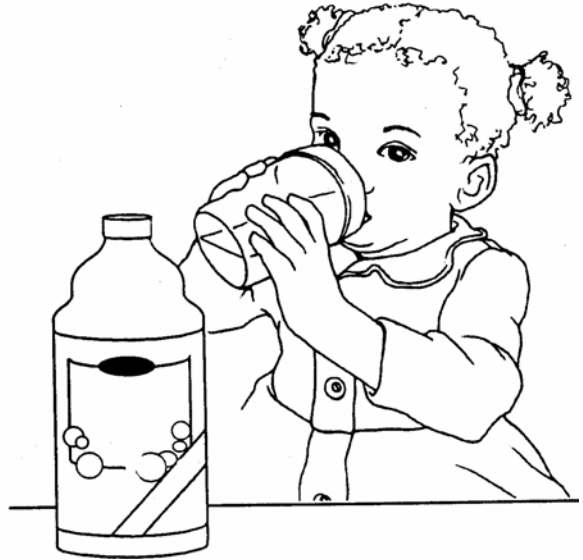
Picture 2 Give your child lots of liquids to drink.

If you need a doctor for your child, call the Nationwide Children's Hospital referral and Information Line at (614) 722-KIDS.