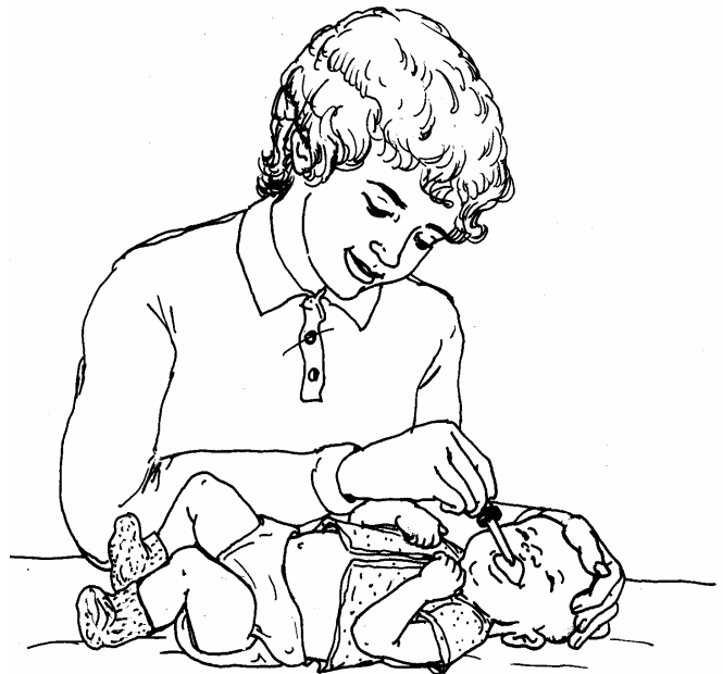
Picture 1 Slowly drop the medicine onto the white patches inside your child's mouth.