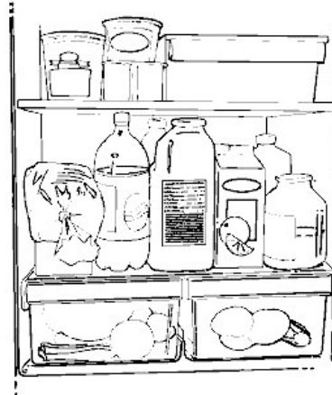
Picture 2 Keep urine in the refrigerator or on ice.

If you have any questions, be sure to ask your doctor or nurse, or call _____.