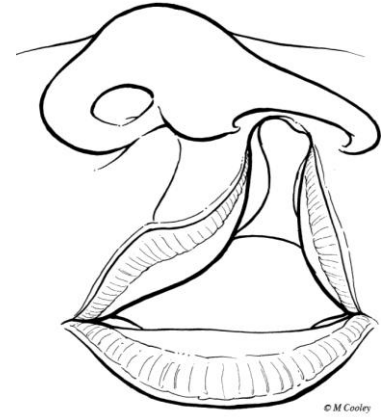
Picture 1 Cleft lip.

While the incision is healing, your baby should sleep on his back to prevent rubbing the upper lip on the bed.