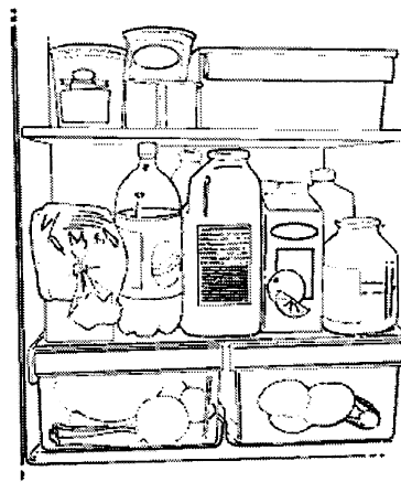
Picture 2 Keep urine in the refrigerator or on ice.

If you have any questions, be sure to ask your doctor or nurse, or call _____.