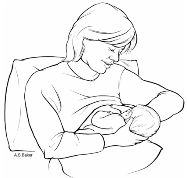
Picture 1 Breast-feeding your baby can be a special time for both of you.