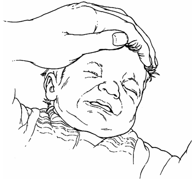
Picture 1 Gently rub the baby's head to help her fall asleep.