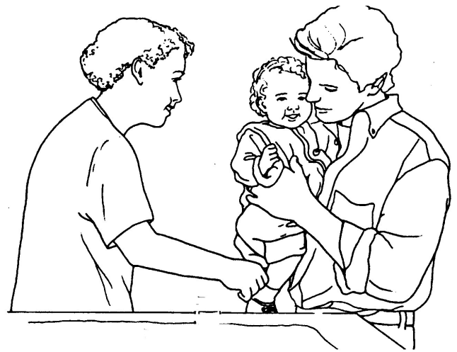
Picture 1 The doctor will examine your baby and may order some tests.