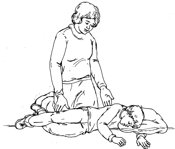
Picture 1 Turn your child's head to the side and point the face downward.